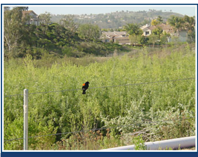
Deshecha Riparian Restoration Red-winged Blackbird