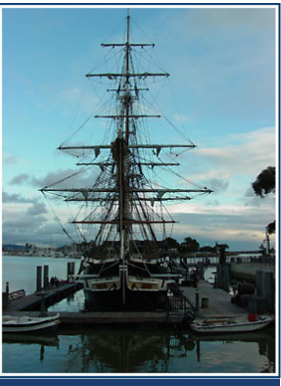
Tall Ship in Dana Point Harbor