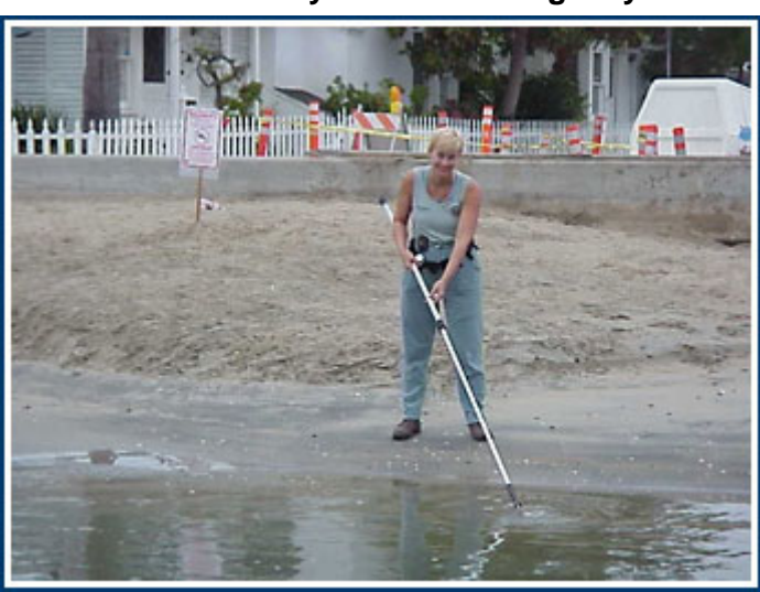
Newport Beach Water Sampling