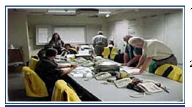
Policy makers rehearse at the Emergency Operations Center so that systems and procedures will be flawless when the crisis is the real thing.

The following is a guide from the Sheriff's Office of Emergency Services to help you prepare for the first 72.