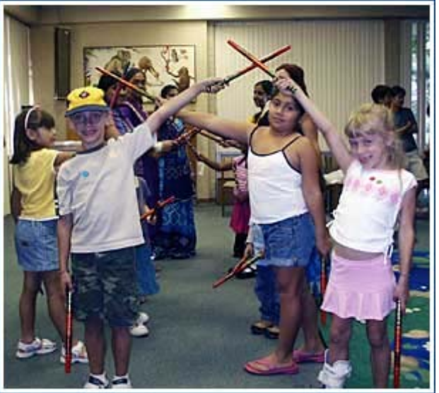
with teens from Diamond Bar High School (rear) at the La Habra Library.

Notably, Orange County's Public Library System has one of the most successful teen summer reading programs in the state. Last summer, more than 2,800 Orange County teens joined a summer reading program at their local libraries with 1,544 teen volunteers Children celebrate the "Sounds and Tastes of India" contributing more than 25,250 hours.