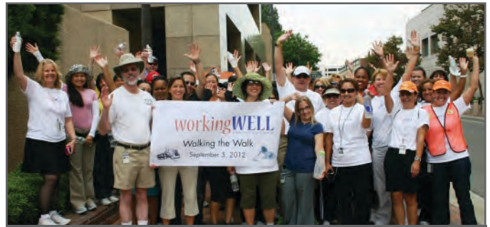
At the kickoff event celebrating HCA's new employee wellness initiative, 60 employees completed a 1.9 mile organized walk.

To keep the momentum moving forward, HCA is launching a new workingWELL intranet page which includes a wide variety of resources and information related to HCA employees' wellness. The site will feature information about the initiative, interactive blogs, poll questions and practical resources for visitors to enjoy. ■