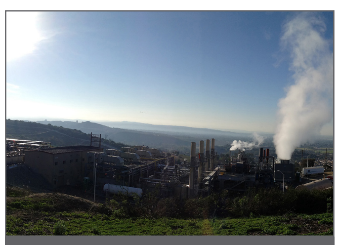
With a production capacity of 37.5 megawatts, the Brea Power II plant is the second largest landfill gas energy project in the United States, and the largest facility of its type in California.

OC Waste & Recycling is the proud recipient of the United States Environmental Protection Agency's Landfill Methane Outreach Project of the Year award. The 2012 award was given to the partners that collaborated on the new landfill gas energy plant at the Olinda Alpha Landfill located in Brea.