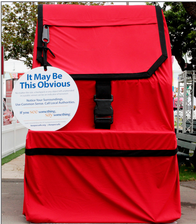
The 10-foot-tall red backpack made its debut at the OC Fair for the kick-off of the campaign. It is currently on display at John Wayne Airport in Terminal C until August 13.

The following are a few examples to help you identify a questionable object or behavior: