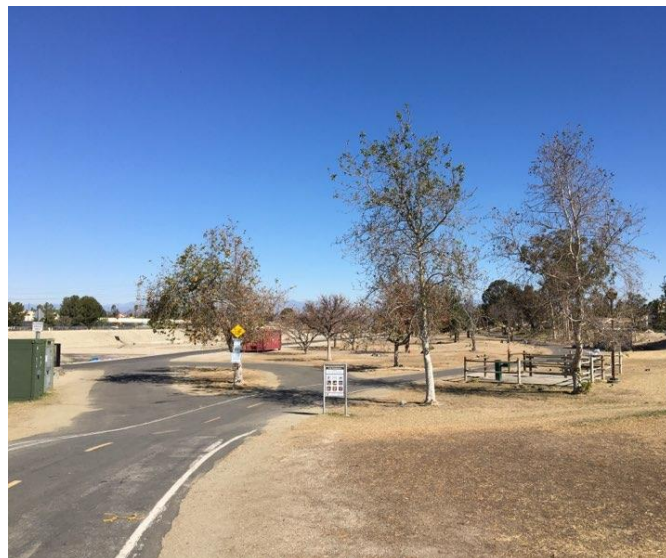
After: Picture taken Tuesday, February 27, 2018, after individuals exited the Santa Ana River Trail and connected with resources.