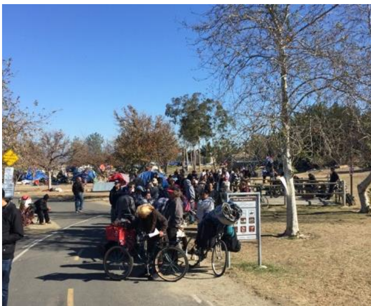
Individuals line up to receive services from Health Care Agency Behavioral Health Services Outreach & Engagement on Tuesday, February 20, 2018.

County staff and contractors are connecting with those placed in motels to conduct a clinical assessment of their social service and sheltering needs.