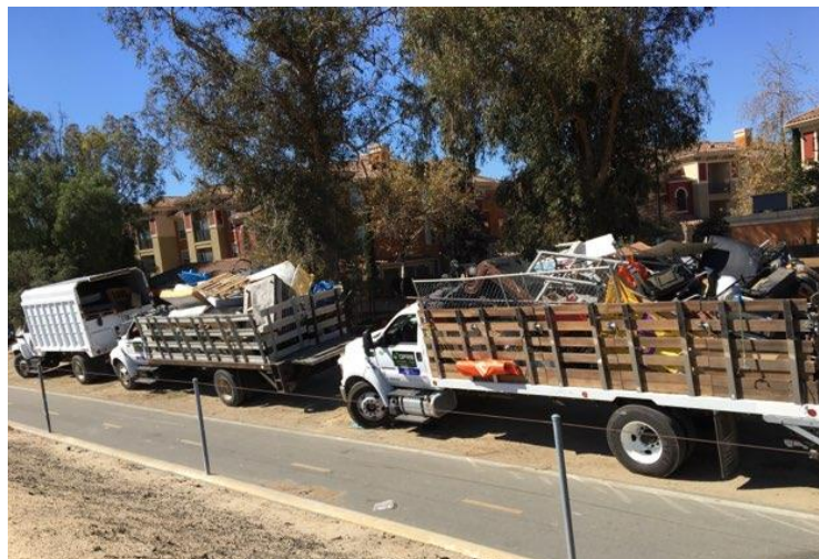
OC Public Works trucks clearing debris from the Santa Ana Riverbed Trail as part of the environmental remediation project.