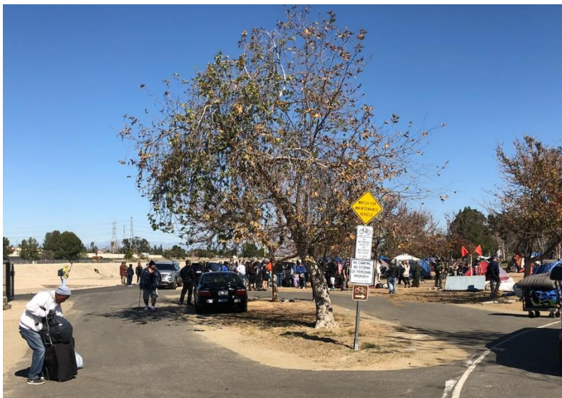
Picture taken Tuesday, February 20, 2018, with individuals collecting their belongings and in line to connect with services north of Katella Avenue.