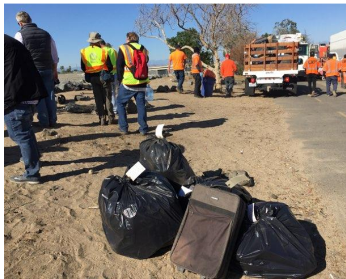
Orange County Public Works and County Counsel work with individuals encamped along the Santa Ana River Trail to identify items to be stored and items to be removed as part of environmental remediation project.

Stakeholders who wish to contribute to the success of this effort should reach out to City Net at citynet.org , The Midnight Mission, the operator of the Courtyard Transitional Center, at www.midnightmission.org/program-services/thecourtyard or Mercy House, the operator of Bridges at Kraemer Place, at mercyhouse.net/portfolios/bridges-at-kraemer-place .