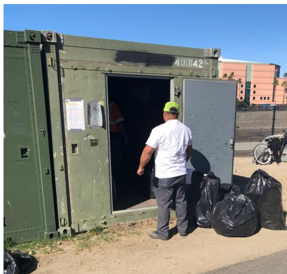
OC Public Works is storing property for individuals exiting the Santa Ana Riverbed Trail for up to 90 days.