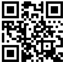
Operation Santa Claus

For more information about Senior Santa and Friends, please call (714) 825-3111 or e-mail Senior.Santa@ssa.ocgov.com .