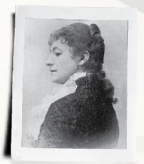
Helena Modrzejewska (1840-1909)